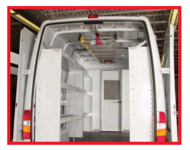
Fits most vehicles including enclosed trailers and Sprinter vans.