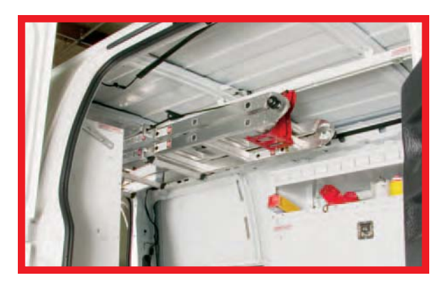
Works with most ladders up to 8 ft. including multi-position ladders.