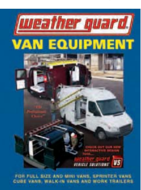
WEATHER GUARD® Van Equipment Catalog