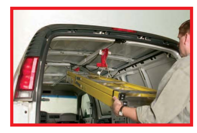
1. Place the top of the ladder into the front cradle assembly.